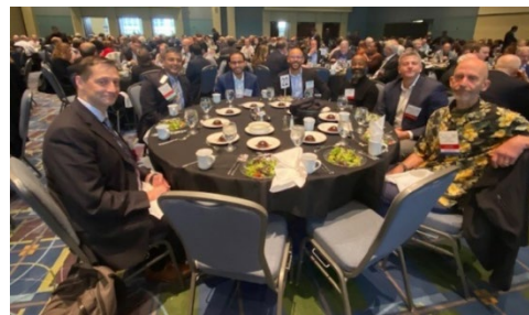
2023 Council Meeting Luncheon Philadelphia, PA.